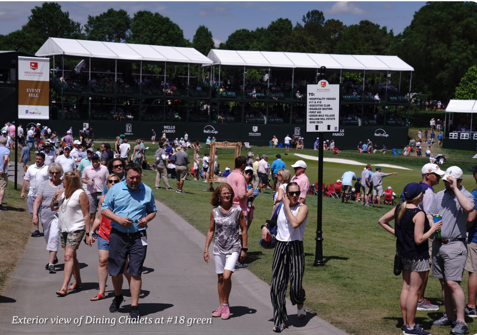
Exterior view of Dining Chalets at #18 green

April 27 - May 3, 2020 | Quail Hollow Club WellsFargoChampionship.com • (704) 554-8101