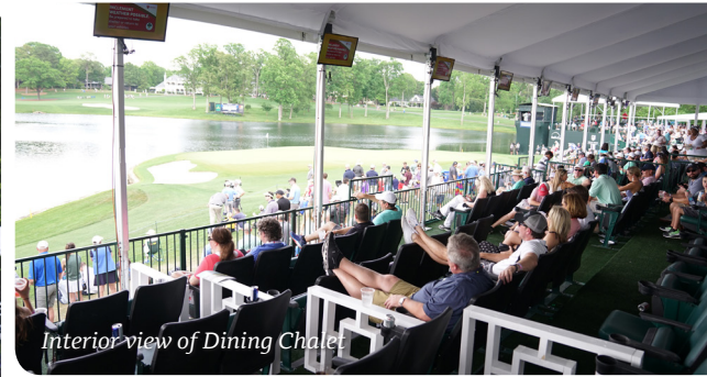
Interior view of Dining Chalet