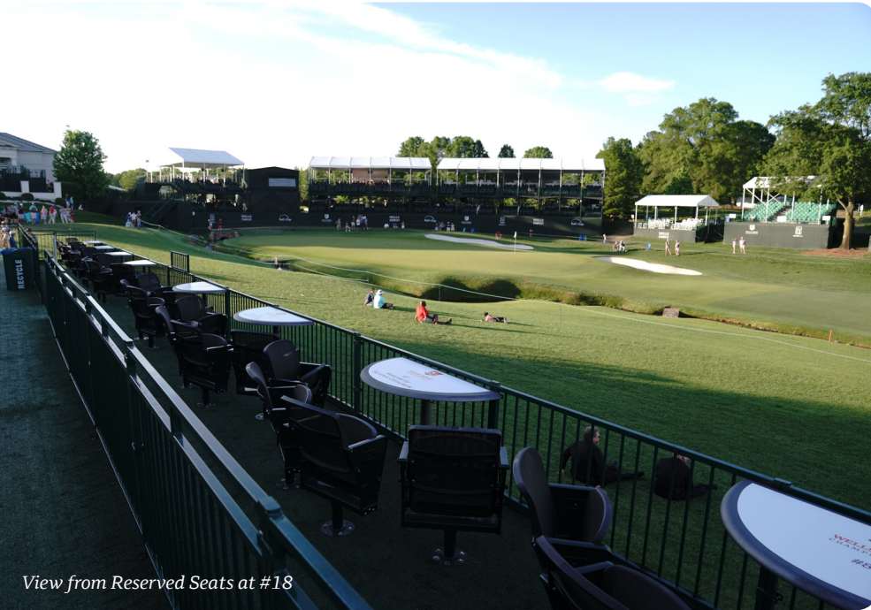
View from Reserved Seats at #18