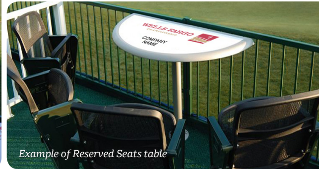
Example of Reserved Seats table